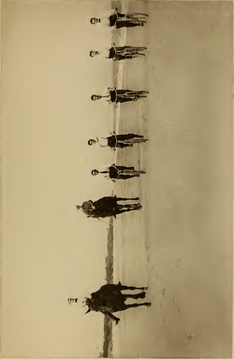
ATLANTIC OCEAN BEACH